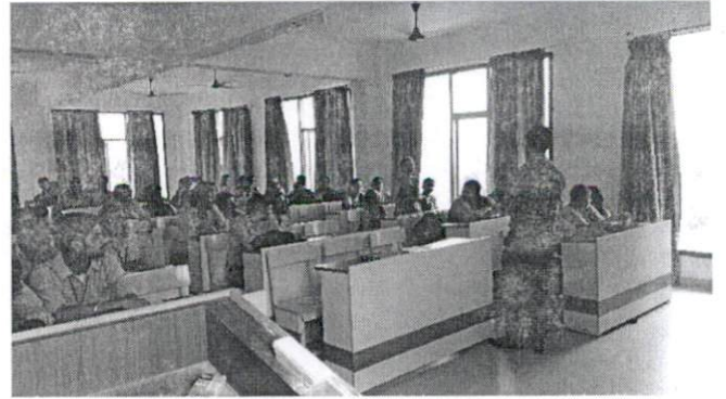
Civil Services Coaching Class in progress 13-Sept-2015